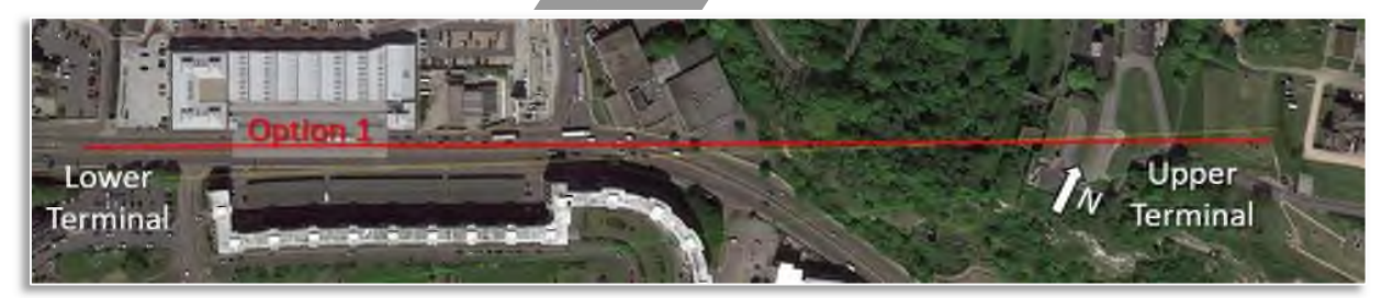
Figure 9 – Alignment Option 1