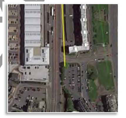
Figure 5 - Option 2 Lower Terminal

The Option 2 alignment allows lower terminal to be placed adjacent to the A20 roadway in an existing parking area. The disadvantage of this option's lower terminal placement is the result that the cable car alignment passes over the housing complex property and much closer to the housing complex building just upline of the lower terminal location.