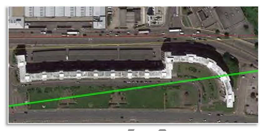
Figure 6 – Housing Complex

This alternative was selected because it approximately begins and ends in the same locations as Options 1 and 2, but avoids travel over the A20 other than for a short segment northeast of the housing complex. This option also avoids passing over the Leisure Center Property, but travels over the housing complex for a significant distance and over a portion of the housing complex building.