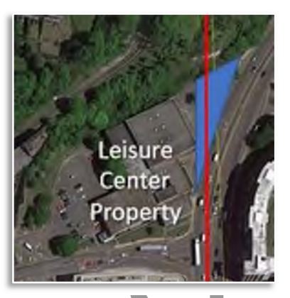
Figure 2 – Leisure Center Property

Option 1: This alternative was selected as it mostly avoids travel over private property. The Dover Leisure Center property is minimally impacted by the cable car system traveling over the property corner.