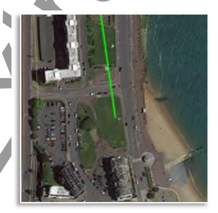
Figure 7 - Option 3 Lower Terminal

The Option 2 alignment allows lower terminal to be placed in the park between the roadways of Camden Crescent and Marine Parade.