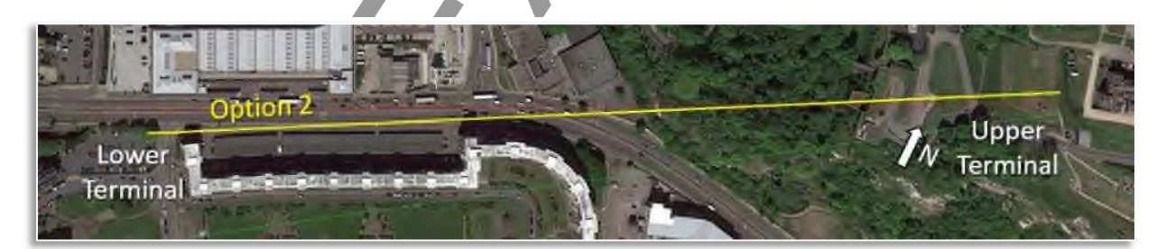
Figure 10 – Alignment Option 2