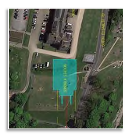
Figure 8 – Upper Terminal Location

The upper terminal location was selected primarily for its ability to keep the alignments within public right-of-way and to prevent the cable car right-of-way from passing over additional properties or structures. It is understood that the upper terminal location lands passengers approximately 250 meters from the Castle entrance, but without an additional cable car segment and an additional cable car station, it was not possible to place the upper terminal station significantly closer to the Castle without introducing many of the disadvantages discussed above.