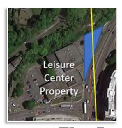
Figure 4 – Leisure Center Property

Option 2: This alternative was selected as it mostly avoids travel over private property and it allows for the lower terminal to be placed in the parking lot south of the A20. The Dover Leisure Center property is minimally impacted by the cable car system traveling over the property corner.