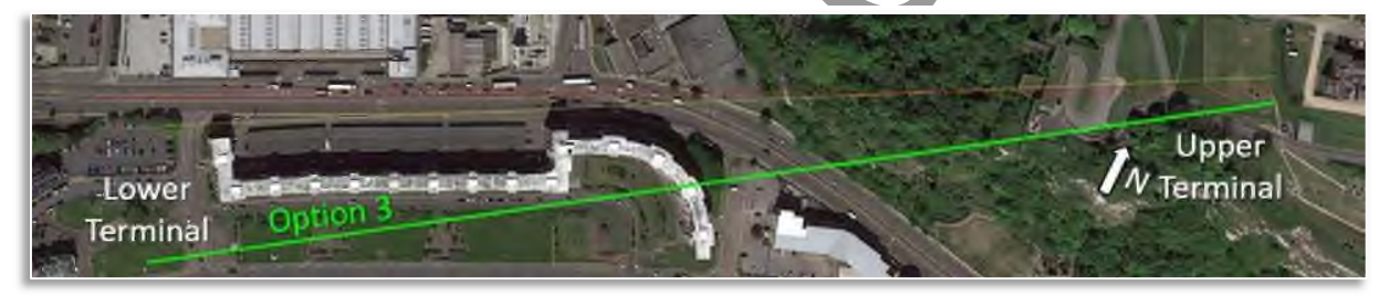
Figure 11 – Alignment Option 2